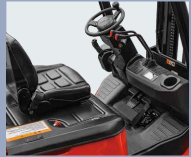
The truck is ergonomically designed to provide a good view and a large operating space