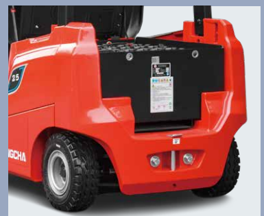
Battery is placed at the rear of the truck