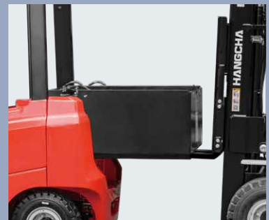
The battery can be removed from the rear enables the battery to be replaced more flexibly (Only for the lead-acid battery)