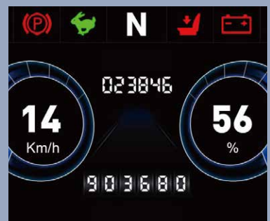
Multifunctional color screen instrument with graphical interface design is simple and intuitive for operator