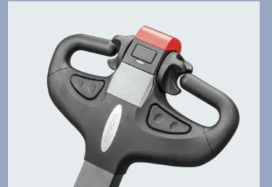
The modular tiller is simple but reliable and beautiful, all parts inside it can be replaced separately and all operations can be done easily with one hand