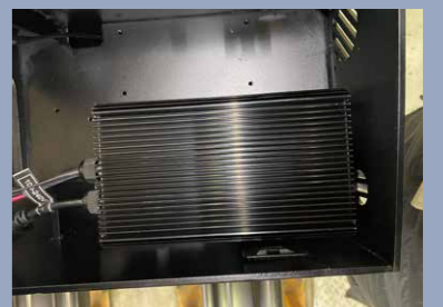
Built-in charger, charging is more convenient