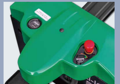
Body feature smooth lines and affluent sense of movement, and compact profile, in accord with the latest appearance design trend