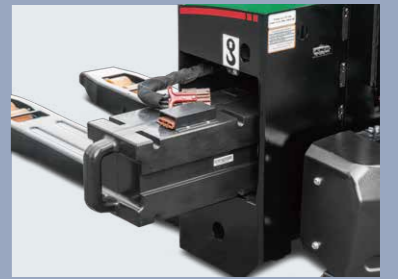
Easy for exchanging battery