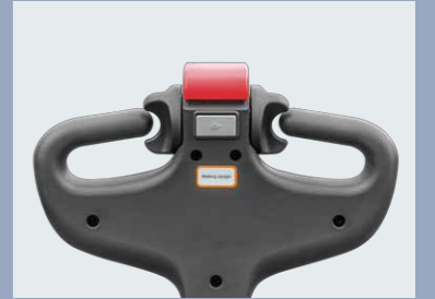
The upright-tiller running function allows it to work within confined space, such as container