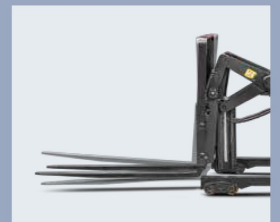
Mast tilting function is easy for entry in/out the pallet