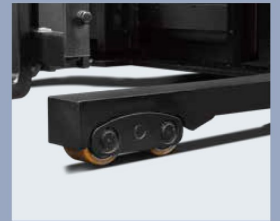
The structure of rotary load wheel offers the truck better passing ability