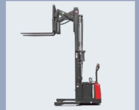
Travel speed is lowered automatically when fork is lifted to specified height