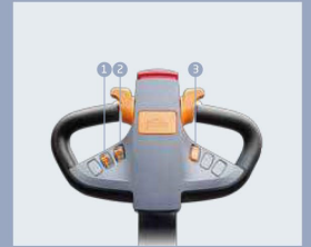
FREI multi-function tiller 1: Forks move forward / backward 2: Forks lifting / lowering 3: Forks tilt forward / backward