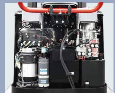
Cover can be opened fully