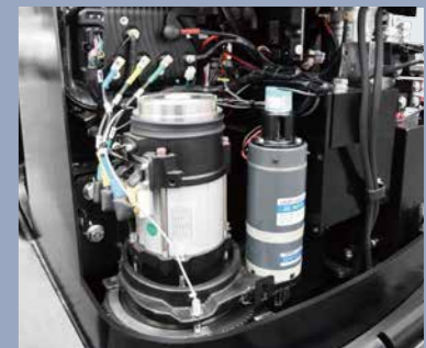
EPS (Electric Power Steering) is standard specification