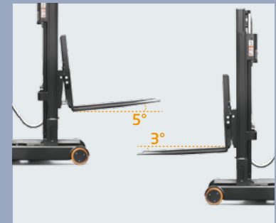
Fork tilt F/R: 3° / 5°