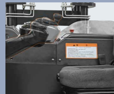
The steering wheel is extensible, so the operator can choose the best driving position