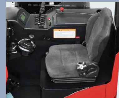
Comfortable and convenient seat

/ The driving system that is located at rear part of chassis uses EPS (Electric Power Steering) technology, features low-speed and large torque. The 180-degree steering mode of standard configuration, make the truck flexible and convenient, and allow it turn easily even in confined space.