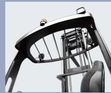
Wider view OHG

/ The worldwide popular, great-circle, streamlined surface modeling is applied, with smooth, beautiful, and elegant appearance.