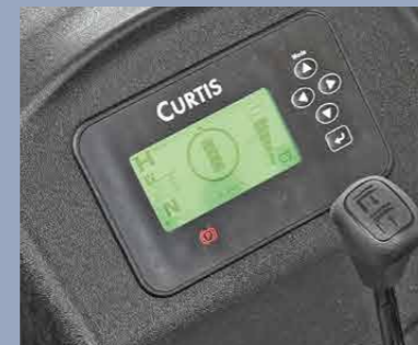
Instrument can display the steering angle and direction Synchronously